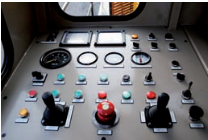
Ergonomic driver desk with joysticks for traction/brake control